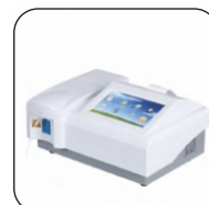
Biochemistry Semi-Automatic Analyzer