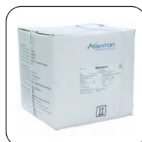
Hematology Analyzer reagents